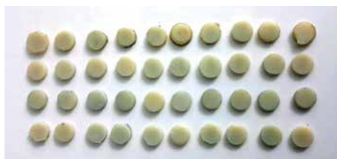
Figure 2. The provisional restorative materials evaluated in terms of colour change have been presented below from top to bottom: listerine, colgate, sensodyn and green tea samples, respectively.

The first colour measurements of the samples were made soon after they had been prepared, while the second measurements were made 14 days after they had been stored in the solutions. The measuring process was carried out with the aid of a digital spectrophotometer (VITA Easy shade Compact Advance 4.0, VITA Zahnfabrik H. Rauter GmbH & Co.KG), during which the suggestions by the producing company were taken into consideration. That is, the device was calibrated at regular intervals and measurements were made upon a white surface under D65 standard light conditions. The spectrophotometer used in this study is capable of measuring in colour values of vitapan classic and vitapan 3D-master, and has got a heat range of 15-40°C, apart from being a rechargeable device fitted with a White High Power LED light lamp. The measurements achieved upon the surface of every single sample were repeated three times before the mean values for L*, a* and b* could be recorded. The differences observed in the colour were calculated using the following formula (8, 14): \Delta E = ((L_1^* - L_0^*)^2 + (a_1^* - a_0^*)^2 + (b_1^* - b_0^*)^2)^{1/2} . L1, a1 and b1 values stand for CIE L* a* b* values after the samples had been stored in the drinks, while