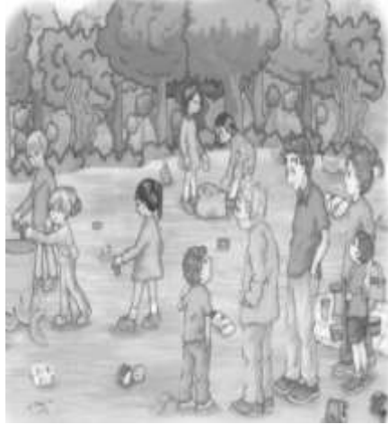
Figure 3. Clothes (Third Grade)