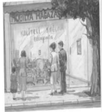
Figure 4. Clothes (Fourth Grade)