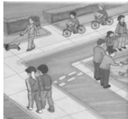
Figure 8. Physical appearances (Second Grade)