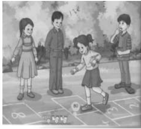
Figure 2. Colors (First Grade)

The clothes of males and females in the primary school Turkish textbooks were examined. The clothes worn the most in the first grade textbooks were in the following order: dress, shirt, t-shirt, and skirt for females; shirt, trousers, t-shirt, and vest for males. The most frequently worn clothes in the second-grade textbooks were in the following order: skirt, t-shirt, shirt, trousers, blouse, and dress for females; shirt, trousers, t-shirt, shalwar, and sweater for males. The clothes worn in the third grade textbooks were in the following order: skirt, dress, shirt, and trousers for females; shirt, trousers, military uniform, and shalwar for males. The most frequently worn clothes in the fourth-grade textbooks were in the following order: shirt, blouse, trousers, t-shirt, and shalwar for females; trousers, shirt, jacket, and t-shirt for males. It was observed that females were depicted wearing dresses and skirts in general while males were depicted with trousers and shirts. Examples of pictures are given below in Figure 3-4.