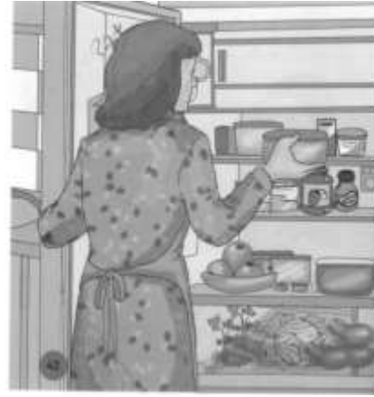
Figure 5. Co-operation (Fourth Grade)