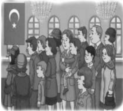
Figure 9. Physical appearances (Third Grade)

Physical appearances were examined in the primary school Turkish textbooks in terms of weight, hair color, and hairstyle, skin color for females; and hair color, hair length, and skin color for males. Females and males were depicted mainly as slim with the exception of a few overweight females and males. Females in the first, second, third and fourth grade Turkish textbooks had black, brown, red or yellow hair. Their hair was depicted with a knob, double or single pony tails. Haircuts were usually pageboy style; and short hair was rare. Females were depicted with normal height and weight. Very few overweight people were included, and they were old people. Females in the pictures were mostly light skinned. Males' hair was mostly neither very short nor very long in the first, second, third and fourth grade textbooks. The hair colors were black, brown, white, and red. Males were depicted as light skinned with a shaven beard. There were also bald and bearded men. Examples of pictures are given below in Figure 9-10.