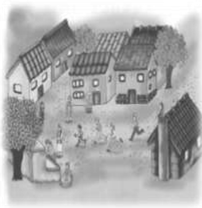
Figure 1. Colors (Third Grade)

(n = 5) for females, while the most used colors for males were brown (n = 64), green (n = 56), blue (n = 51), orange (n = 37), yellow (n = 28), purple (n = 27), white (n = 20), red (n = 17), and purple (n = 7). The most used colors in the fourth grade textbooks were white (n = 38), blue (n = 33), pink (n = 13), orange (n = 11), yellow (n = 10), black (n = 8), and red (n = 7) for females, while the most used colors for males were blue (n = 34), white (n = 30), grey (n = 25), green (n = 18), brown (n = 16), orange (n = 13), yellow (n = 10), and red (n = 9). Female and male characters wore different colors. Examples of pictures are given below in Figure 1 and 2.