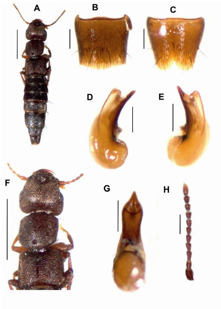
Figure 1. Details of Astenus (Eurysunius) sandiklicus sp. n. A—habitus; B—male tergite VIII; C—male sternite VIII; D and E— aedeagus, lateral view; F— forebody; G— aedeagus, ventral view; H— antenna. Scale bars: 1.0 mm (A and F); 0.2 mm (B-E and G-H).

Pronotum weakly transverse (see ratio PW/PL and Figs. 1A, F), 1.10 times as wide as long and approximately 0.86 times as wide as head (see ratio PW/HW, Figs. 1A, F); widest at anterior angles, distinctly narrowed posteriorly; anterior and posterior angles each with long seta of little more than half the length of lateral margin of pronotum; posterior margin convex; dorsal surface without pronounced impressions; microsculpture almost absent; puncturation similar to that of head, but slightly sparser, surface somewhat more shiny than that of head; pubescence of similar length as that of head, but less fine and more conspicuous.