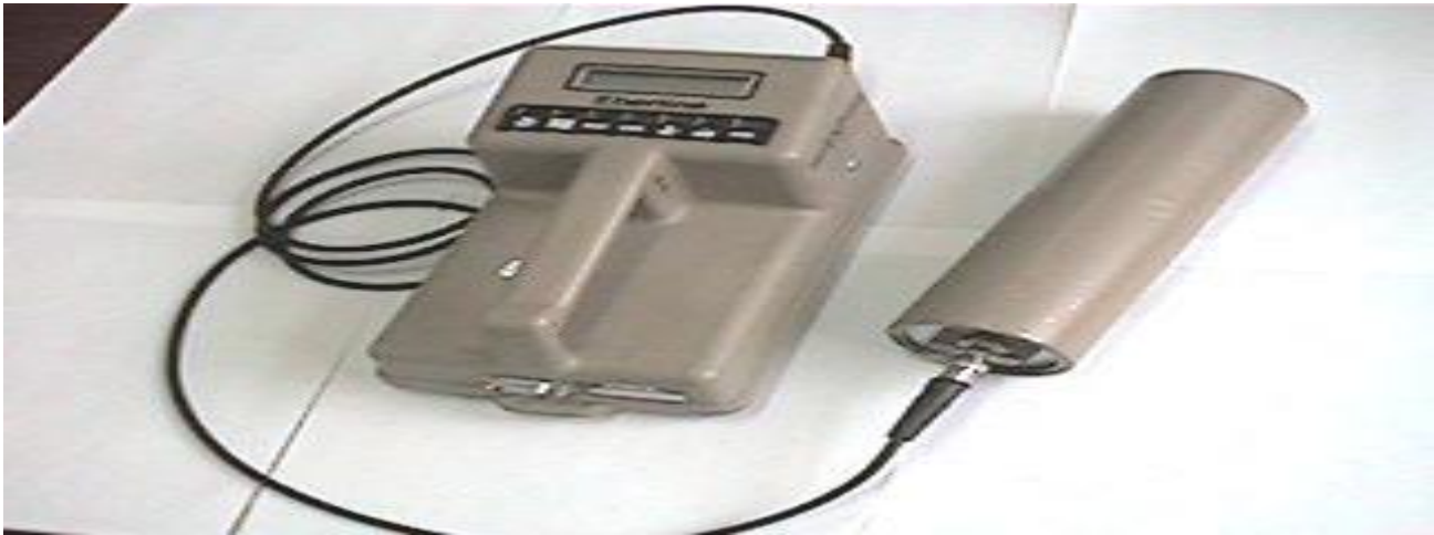
Figure 2: ESP-2 Rate meter and SPA-6 scintillation detector, Eberline [4]