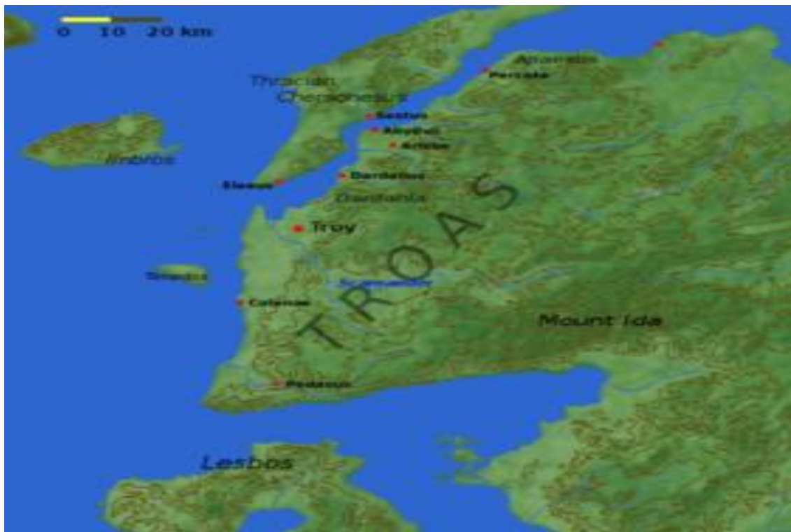
Figure 1: Regional Map of IDA Mountains, Turkey [3]

IDA mountains, the northwestern region of Turkey, are closed to Egean Sea. some 20 miles southeast of the ruins of Troy , along the north coast of the Gulf of Edremit . It is located to 39°37'- 39°27' N as latitudes and 26°56'- 26°16' E as longitudes. Highest pick is Karataş (1774 m). It is located between Edremit (Balıkesir) and Ayvacık (Çanakkale). The summit is windswept and bare with a relatively low tree line due to exposure, but the slopes of this mountain, at the edge of mild Mediterranean and colder central Anatolian climate zones, hold a wealth of endemic flora, marooned here after the Ice Age. The climate at lower altitudes has become increasingly hot and dry in the deforested landscape. The dry period lasts from May to October. Rainfall averages between 631 and 733 mm per year. The mean annual temperature is 15.7 degrees Celsius. Currently a modest 2.4 km 2 of Mount Ida are protected by Kaz Dağı National Park, created in 1993 [2]. Location of Mount Ida is shown in Figure 1.