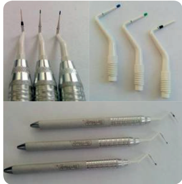
Fig. 1. Hu-Friedy Colorvue® phenotype probe

The patients to be included in the study were selected among the individuals who had taken the CBCT be-