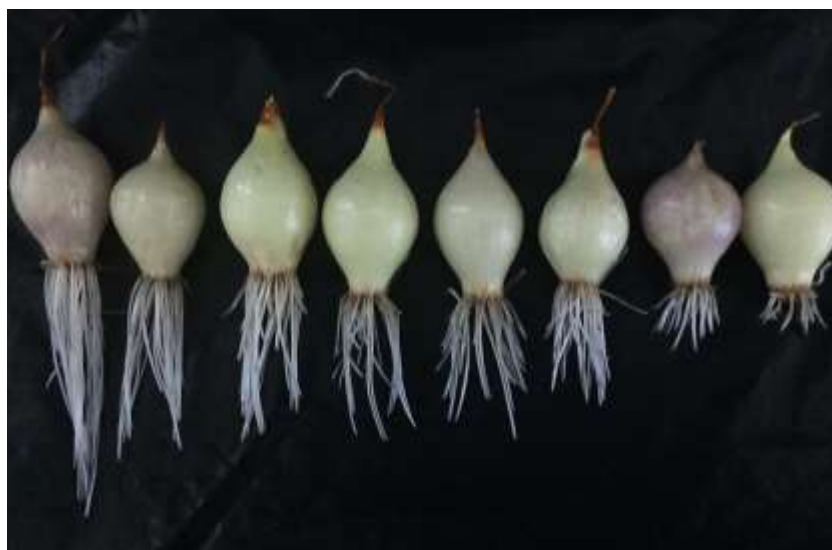
Figure 1. EC 50 determination of 2-CPY on A. cepa root meristematic cells. Doses from left to right 0, 5, 10, 25, 50, 100, 200 and 400 ppm.

A. cepa ana-telophase test was performed according to Rank and Nielsen (1994) with slight modifications. Onion bulbs were kept in the distilled water for two days to reach a length of 2-3 cm at room temperature (21 ± 4°C) in the dark. Roots were exposed to ½xEC 50 (25 ppm), EC 50 (50 ppm) and 2xEC 50 (100 ppm) concentrations of 2-CPY along with negative (distilled water) and positive control (MMS, 10 ppm) for 24, 48, 72 and 96 h. Three onions were used for each application. 15-20 root tips about 1 cm long were fixed with Carnoy fixative (1:3 glacial acetic acid/ethanol, v/v) at 4°C for 24 h.