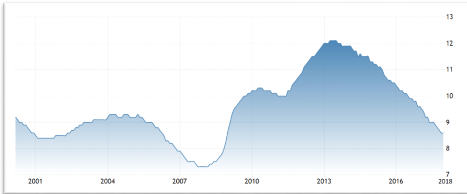
Chart: 1 Unemployment Rate of Eurozone (2008-2018)

it, unemployment has begun. Markedly increased. As of 2009, the eurozone unemployment rate was 9.6% - the highest rate recorded in ten years.