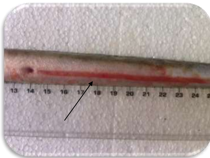
Figure 3. Hemorrhagic anal fin (arrowed) and hemorrhages around the anus and ventral part of silver eel

After 72 hours of incubation period, 10 bacterial strains were isolated. 6 strains produced orange colored colonies on BHIA-S and 4 strains produced cream colored colonies were motile, Gram-negative, cytochrome oxidase and catalase positive. The strains reduced nitrate to nitrite and they showed resistance against vibriostatic agent (O/129) (10 µg/disk and 150