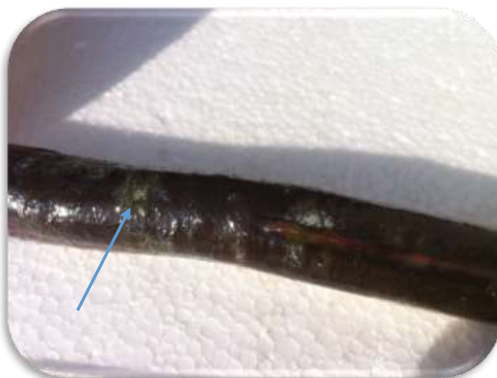
Figure 2. Scale losses (arrowed) and necrotic lesions on the skin in silver eel

and pale spleen. The liver was pale and the gastrointestinal tract was empty.