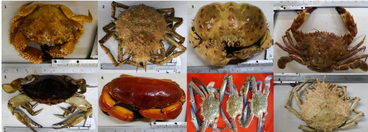
Figure 2. Some brachyuran crabs from the coastal waters of Mersin Bay. E. verrucosa 1 , M. squinado 2 , C. granulata 3 , C. longicollis 4 , C. sapidus 5 , A. roseus 6 , P. segnis 7 , M. crispata 8

In this study, eight brachyuran crab species, E. verrucosa , C. sapidus , M. squinado , M. crispata , C. granulata , were found in Mersin Bay (Figure 2).