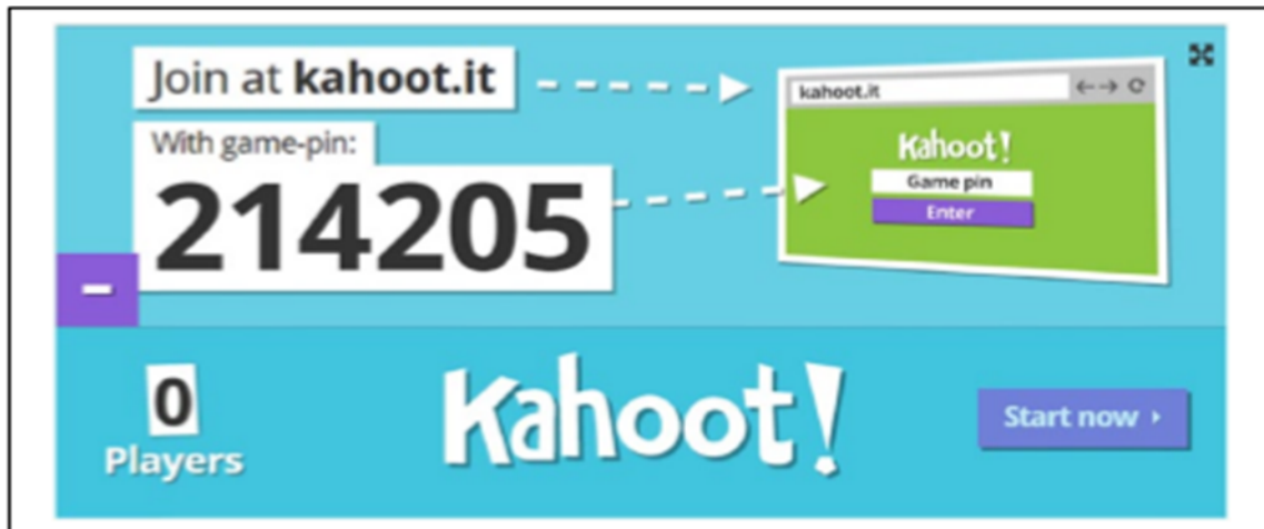
Figure 1. Sample Kahoot! home page with game pin.

Learners can use their smartphones, laptop and tablets or computers. They do not need to register an account and this saves time to start activity at once. Multiple choice questions are presented one by one on the screen and can be played by up to 30 students. Learners click on the right answer to a question on their internet-enabled devices. They receive points for every correct answer. When every learner answers the question or the time that is set by the teacher expires, on teacher's screen the correct answer is displayed. Total results of the answers given by the learners according to their achievement levels are provided with a graph by the application (Figure 2) and players are ranked based on speed and accuracy. After each question, the top five leaders are shown in the scoreboard (Figure 3).