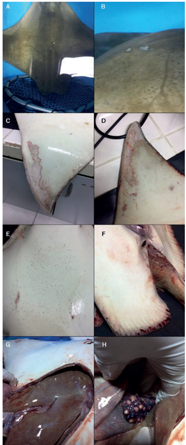
Figure 1. Affected common stingray, (A) Benedenia sp. on the dorsal side of the body, (B) blister on the skin, (C, D) haemorrhages on the ventral side of pectoral fins and skin lesions, (E) petechial haemorrhages on the ventral side of body, (F) haemorrhages on the cloaca, tail and pelvic fins, (G) haemorrhages in the pale liver, (H) pseudotubercles in the spleen.

During the parasitological examination, monogenean parasites were observed in blisters on the skin of the dorsal side of the body (Figure 1). Affected common stingrays had haemorrhages on the ventral side of the body and on the cloaca (Figure 1). Internally, a pale liver or haemorrhages in the liver and pseudotubercles in the examined fish spleen were observed (Figure 1). The parasites were identified as Benedenia sp. following the diagnostic keys outlined by Yamaguti (8). The anterior part of the parasite had a pair of attachment organs and the opisthaptor had a marginal extension surrounding the haptor as a skirt (Figure 2). On the bacteriological examination side; creamy, round, raised, entire colonies of 2–3 mm diameter were formed on the MA. These bacterial isolates appeared as Gram-negative, motile chemo-organotrophic (fermentative) rods and were oxidase and catalase positive. According to their morphological and biochemical characteristics (Table 1) and 16S rRNA and 18S rRNA gene sequencing results, the bacterial isolates that obtained from