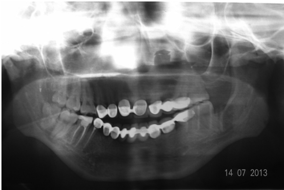
Figure 7. Post-treatment panoramic radiograph

anomalies in this disease is necessary to increase awareness of dentists. The clinical features of ARS can be roughly divided into ocular and non-ocular changes and disease severity shows variation. 12 ARS is genetically heterogeneous and mutations in different genes lead to similar clinical conditions. It has been associated with mutations of two known genes: PITX2 at 4q25 and FOXC1 at 6p25. 13-15 Although systemic findings are suggestive of a PITX2 mutation, FOXC1 mutations cannot be excluded from patients with systemic symptoms. 12 There is no obvious correlation between the localization of the mutations in the genes and the severity of the phenotype. 12