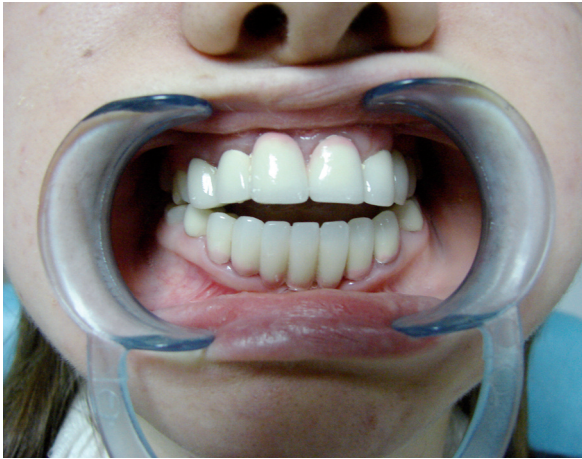
Figure 5. Post-treatment intraoral photograph