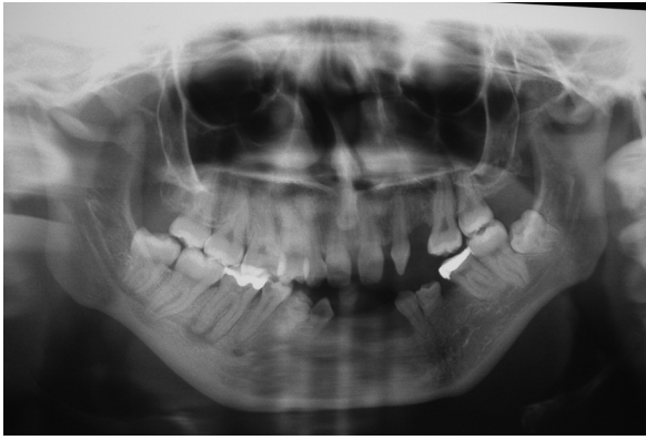
Figure 4. Pre-treatment panoramic radiograph showing the dental anomalies and the pathologies

lip length was less than normative values; this feature indicated to short philtrum. Also, the upper lip was 2 mm retruded from Steiner's S-line and the lower lip protruded 1 mm from this line. Cephalometric measurements of the sella turcica showed that only the depth of the sella turcica increased; the other dimensions were within normal limits.