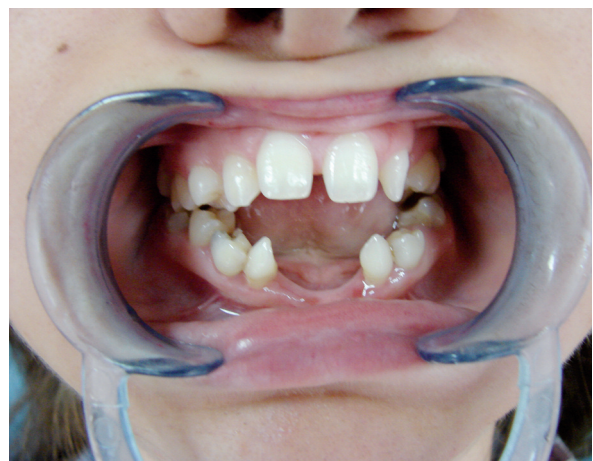
Figure 3. Intraoral photograph of anterior open-bite and mandibular primary teeth

metric results showed that the patient's anterior (S-N) and posterior (S-Ba) cranial base lengths were below the standards of normal values. In vertical plane, the mandible showed clockwise rotation, so the mandibular plane angle and the gonial angle increased. In addition, the lower face height increased, the ramus length and the posterior face height decreased. The increased anterior face height and the decreased posterior face height concluded as a hyperdivergent case. In sagittal plane, increased ANB angle and Witts appraisal pointed to skeletal Class II malocclusion. The patient had retrognathic maxilla due to reduced SNA angle. Decreased Co-A length demonstrated hypoplastic maxilla. Furthermore, the patient had retrognathic mandible according to the SNB angle. Mandibular length reduced because of hypoplastic mandible. Cephalometrically, the upper