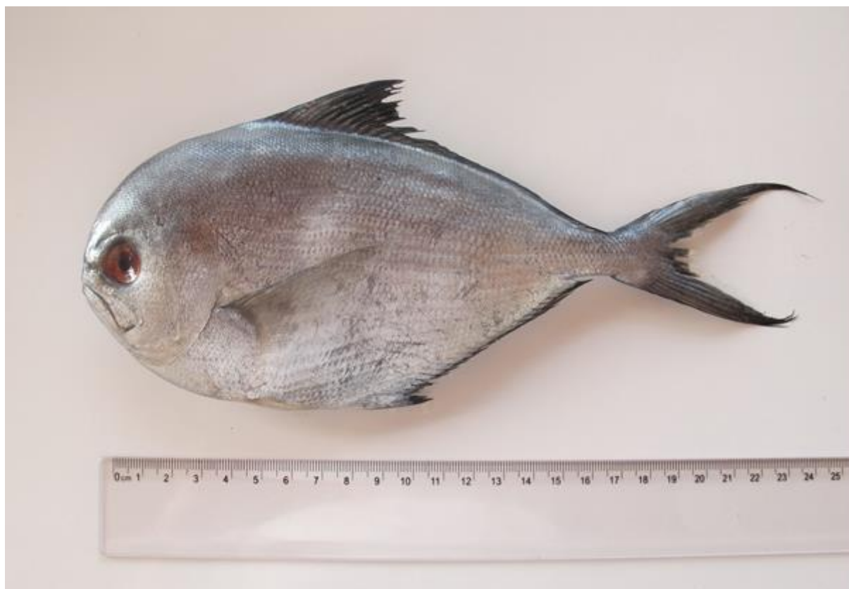
Figure 2. Brama brama sample caught in Iskenderun Bay (MEUFC-19-11-105).