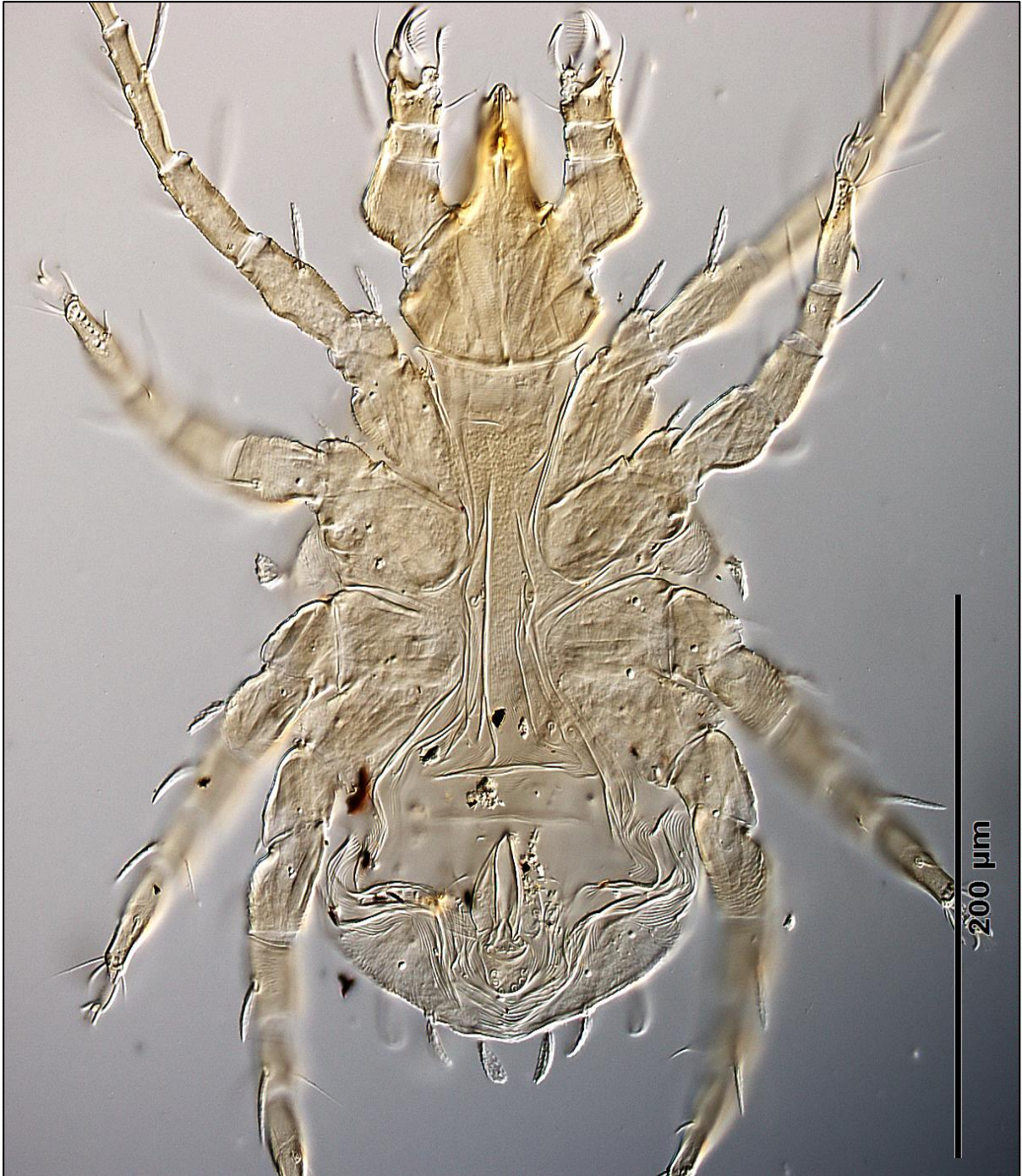
Figure 2. DIC micrograph of Eutogenes frater Volgin (Female) – General view ventrally.