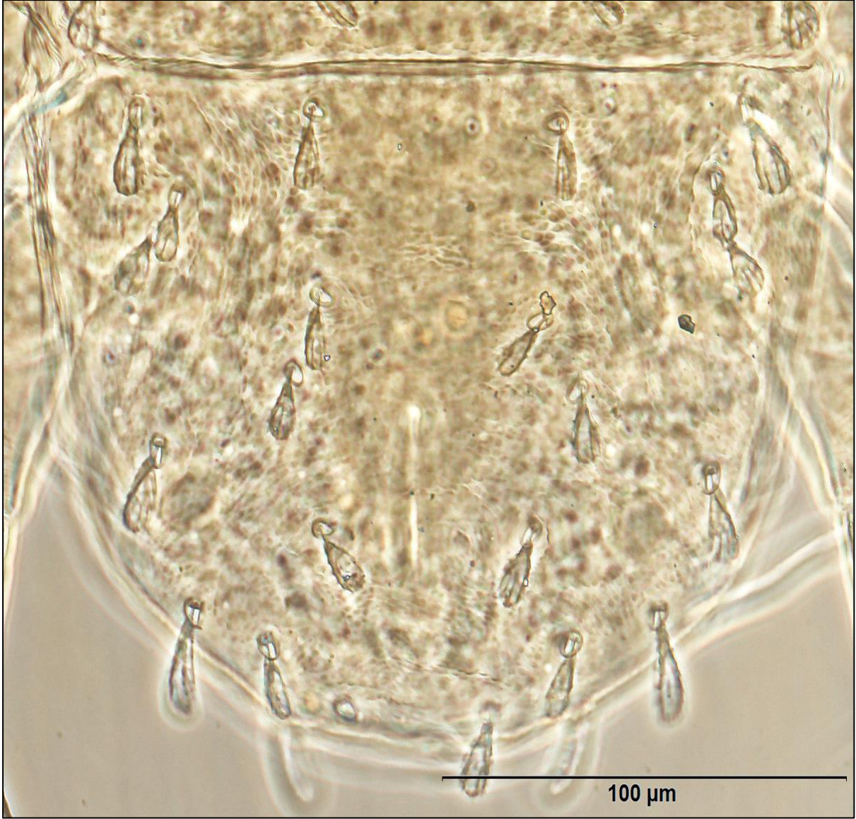
Figure 7. Phase-contrast micrograph of Eutogenes frater Volgin (Female) – Hysterosomal shield.