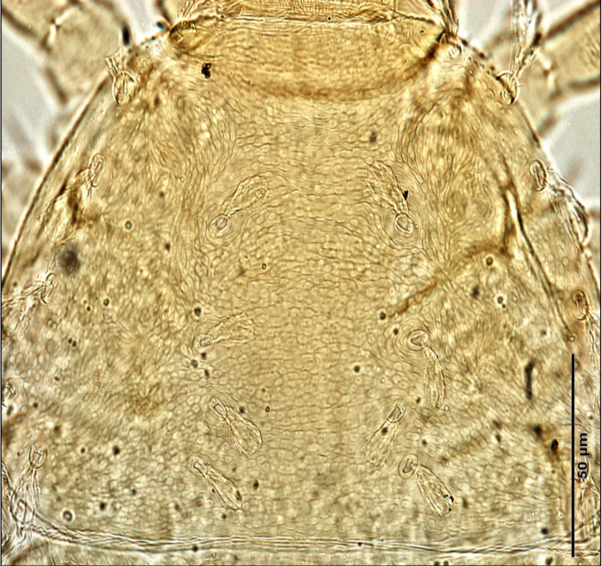
Figure 6. DIC micrograph of Eutogenes frater Volgin (Female) – Propodosomal shield.