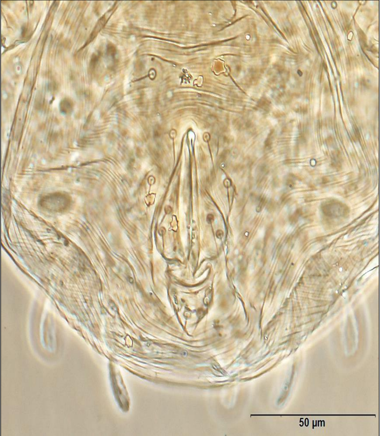
Figure 8. Phase-contrast micrograph of Eutogenes frater Volgin (Female) – Anogenital region.