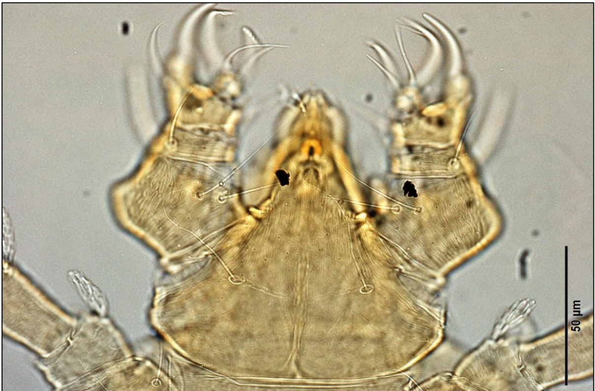
Figure 5. DIC micrograph of Eutogenes frater Volgin (Female) – Gnathosoma in ventral view.