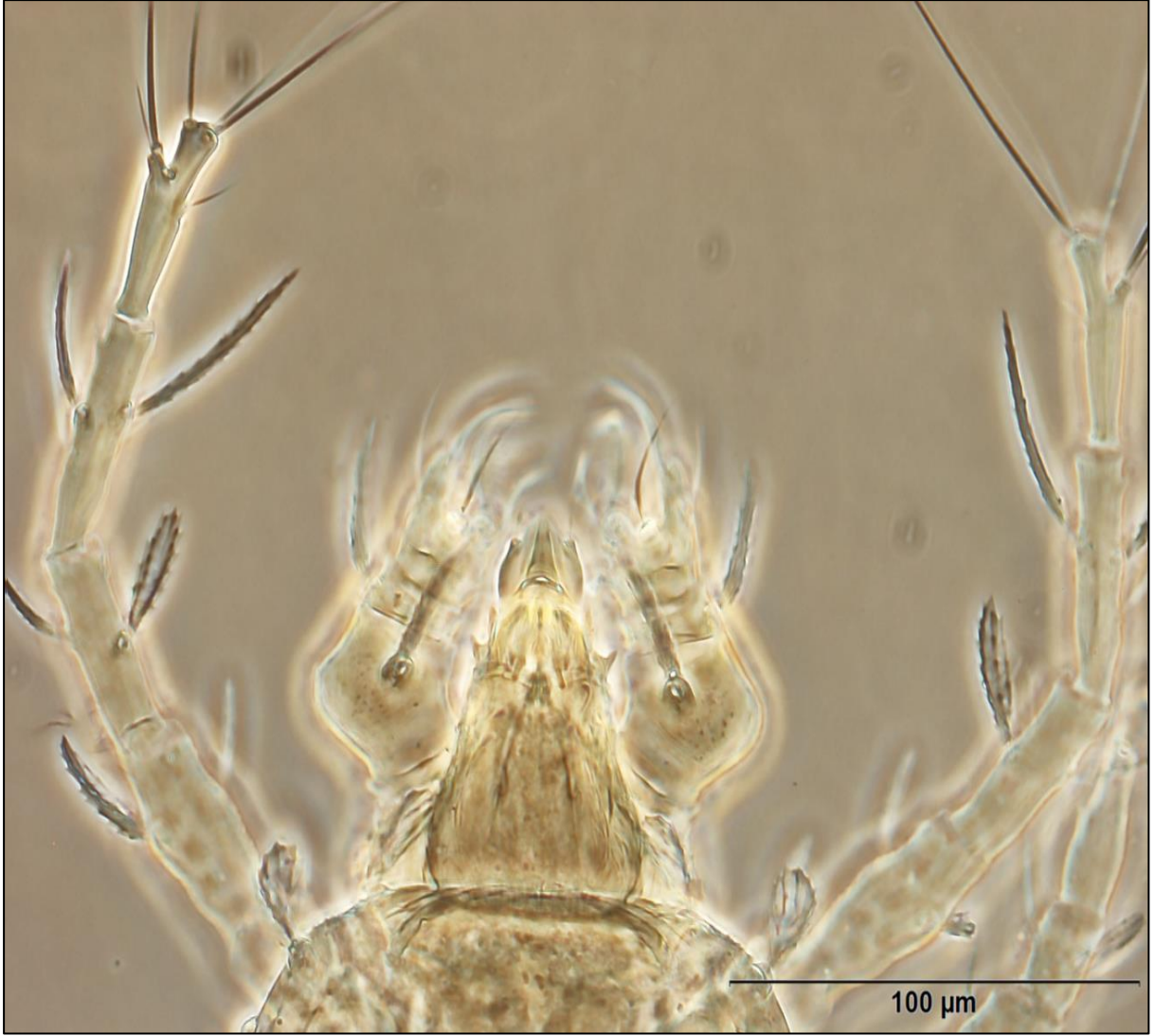
Figure 3. Phase-contrast micrograph of Eutogenes frater Volgin (Female) – Anterior part of the body in dorsal view: gnathosoma and leg I.