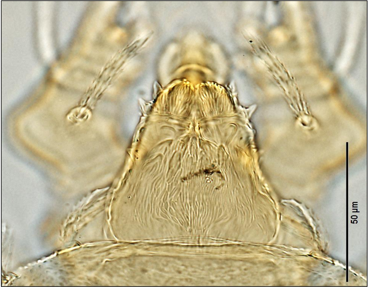
Figure 4. DIC micrograph of Eutogenes frater Volgin (Female) – Gnathosoma in dorsal view.