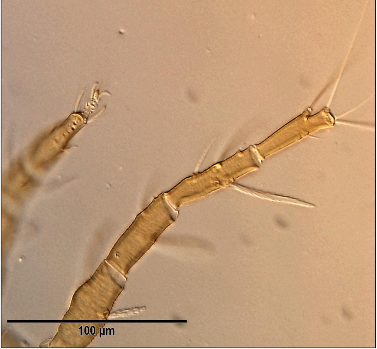
Figure 9. Bright-field micrograph of Eutogenes frater Volgin (Female) – Legs I and II.