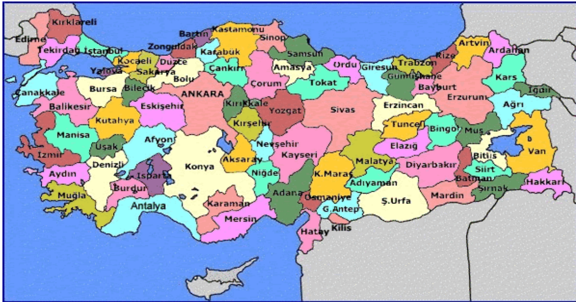
Plan 1: The Provinces of Zonguldak, Bartın and Karabük in Turkey.

Environmental Reports prepared by the planning group, are as follows (Demirci, 2006; Environmental Status Provincial Reports).