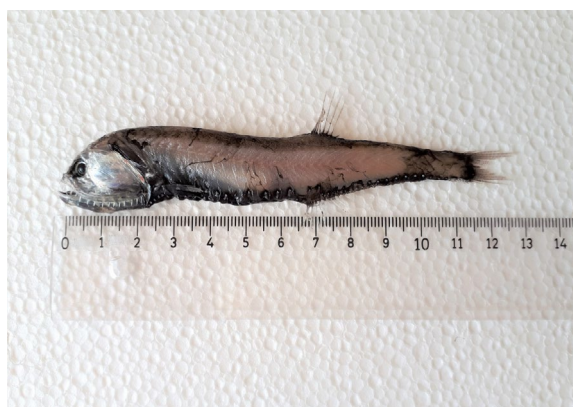
Figure 2. Gonostoma denudatum , 117.5 mm SL from the northeastern Mediterranean coast of Turkey (MSM-PIS/2019-4)