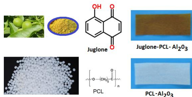
Figure 2 The images of composite films and chemical structures of Juglone and poly( \epsilon -caprolactone)

Juglone-PCL- \text{Al}_2\text{O}_3 composite films with 30% added alumina containing different percentages of Juglone (1% and 5%) were prepared using the roll-mill technique. The alumina and Juglone additives in the specified amounts were added into the PCL polymer melted at 100^\circ\text{C} and mixed. In the next step, the melted mixture was transformed into thin films using the roll-mill. The images of composite films and the chemical structure of Juglone and PCL were given in Figure 2.