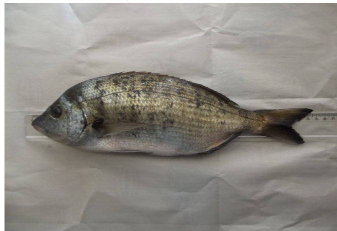
Figure 2. The sharpsnout seabream with 34.6 cm TL and 550.00 g TW

The captured sharpsnout seabream was 34.6 cm in total length and 550.00 g in total weight (Figure 2). The comparison of the maximum lengths and weights recorded for D. puntazzo in the Aegean Sea (with Northern Aegean Sea) is given in Table 1.