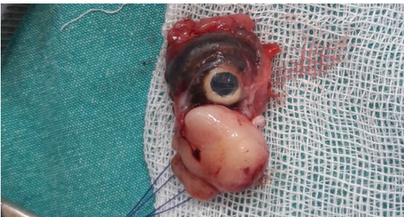
Figure 5. The mass adjacent to the globe