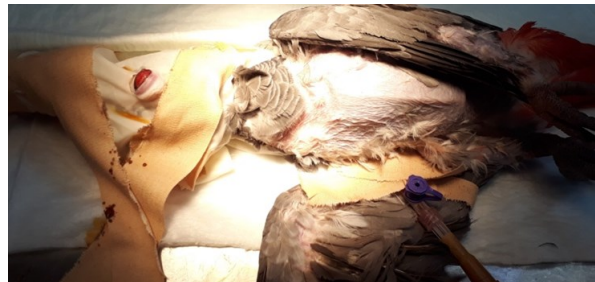
Figure 2. Isoflurane administered via modified glove mask

The bird was induced with 2% isoflurane administered via modified glove mask (Figure 2). On detailed eye examination under anesthesia, yellow-pink, multilobular, hard mass on the bulbar surface of the left third eyelid membrane was detected which was attached to the ventral portion of the bulbar conjunctiva of the globe. Hence, it was decided to remove the globe with the adnexa.