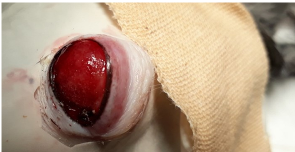
Figure 1. Hyperemic third eyelid membrane

Initial empirical treatment consisted of topical 0.3% ofloxacin (Exocin ® , Abdi İbrahim, Turkey) three times daily, artificial tears (Tears Natural free ® , Alcon, Turkey) three times daily and 1% fusidic acid hemihidrat (Fucithalmic ® gel, Abdi İbrahim, Turkey) two times daily. The patient received oral meloxicam 0.5 mg/ml (Metacam ® , Boehringer, 0.2 mg/kg/24h) and amoxicillin sodium-clavulanic acid (125 mg/kg/PO q12h; Amoklavin suspansiyon ® , Turkey). Following several days of treatment, no clinical improvement of ocular signs was observed. The hemorrhagic exudates were removed but the third eyelid was hiperemic and totally prolapsed, its motility was relatively impeded (Figure 1). The left eye was exophthalmic. Almost every day extensive bleeding was occurred by bird's self-trauma. It was difficult to make an inspection of ocular and internal surface of the third eyelid because of the bird's reactivity.