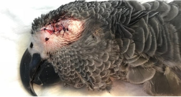
Figure 4. After removal of the mass, eyelids were closed with simple separated suture

separate suture with a 3/0 monofilament polypropylene (Figure 4). After operation, the bird died. The mass with the left globe was removed by the exenteration bulbi method and submitted to Pathology Department (Figure 5).