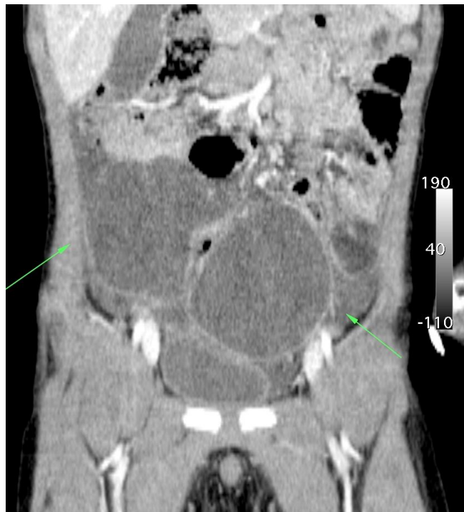
Figure 1: Computer tomography findings for mesenteric cyst. Bilobular cystic mass with dense content in ileal mesentery.

Informed consent was received from the patients' parent.