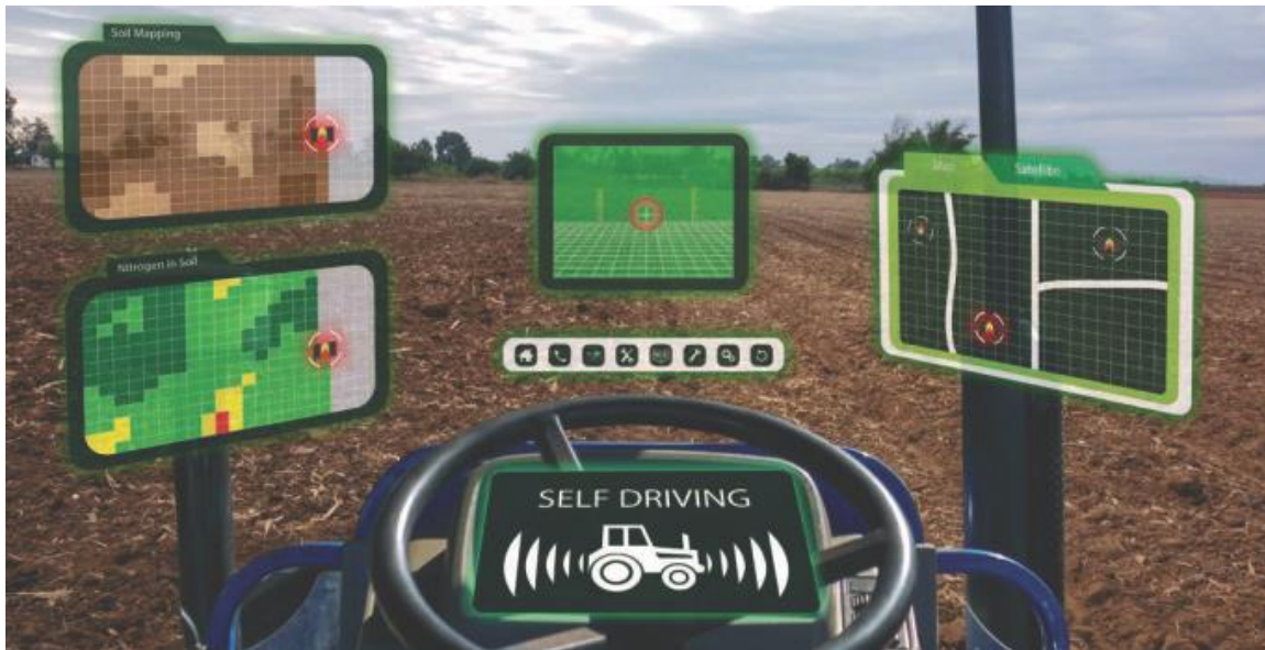
Figure 1. In the future robotic agriculture systems (Duckett et al., 2018)

repetitive and tedious jobs. Some of the most widely used robots in agriculture are: harvesting and harvesting; autonomous mowing, pruning, seeding, spraying and thinning; weed control; Phenotyping; sorting and packing; can be expressed as auxiliary platforms. Indoor and outdoor harvesting and picking is one of the most popular robotic applications in agriculture because of the accuracy and speed that robots can achieve to increase yield and reduce waste from crop crops in the field. However, the automation of these applications can be difficult due to harsh conditions, including vision systems, the presence of dust, variable light intensity, temperature fluctuations, and wind-induced movement (Robotics Online, 2017).