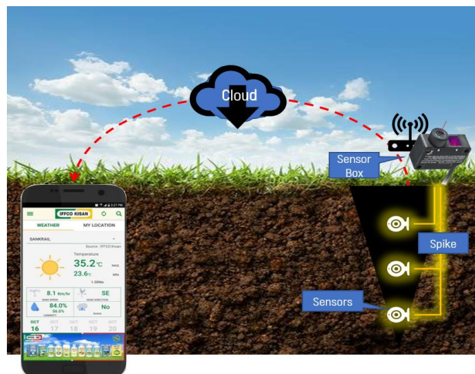
Figure 2. Control of soil condition via smart phone and sensors.

Smart agriculture and precision farming are taking off, but they could just be the precursors to even greater use of technology in the farming world opening doors to the development of farming drones. In another application for the internet of things, the temperature values of the cultivated soil can be monitored instantaneously, and more efficient decision can be made about the cultivation, irrigation and harvesting of the agricultural product. As shown in the figure 2, there are 4 different levels of temperature sensor on a ground pile. These sensors send the temperature values of the current level to the sensor box so that the data in the sensor box can be uploaded to the cloud and the data can be accessed instantly via the smartphone (Meola, 2016).