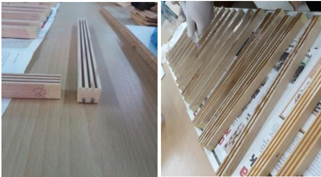
Figure 2. Application of resins to wood samples.

After filling the channels on the first surface with resin, the samples were left on the counter with a balanced scale for 48 hours. Then resin filling was performed on the channels on the second surface. The samples, in this case, were kept for about three weeks. After the resins had been thoroughly dried, the samples were passed through a calibrating sanding machine to remove excess resin on the surfaces. After, samples remained in a conditioning cabin (RH 65±3% and 20±2°C) until they reached a stable weight (TS 2471, 1976). Then, samples were cut into smaller samples according to the specified test standard. The test samples were prepared in the number as to eight repetitions ( n = 8 ) for each variable.