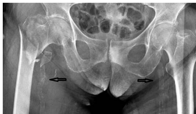
Figure 1. Hip AP radiography of a 90-year old female patient with femoral artery calcification (arrow). (Multifragmentary pertrochanteric fracture, AO classification 31A2.2)

There were no differences observed between the groups in terms of gender, ASA score, anesthesia type, fracture type, complications, and surgery within the first 48 hours ( Table 1 ). Additionally, there were no differences between the groups in terms of age, duration of admission, and operation time. With similar follow-up durations, there was no significant difference observed in the mean death duration between the groups ( Table 2 ).