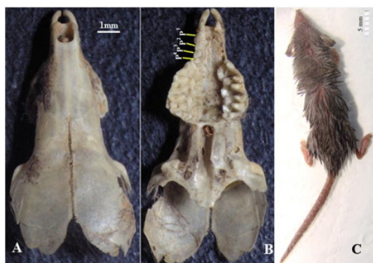
Figure 2. Suncus etruscus skulls were obtained from pellets and alive sample (A-Dorsal, B-Ventral view of skull, C- Suncus etruscus from Karacadağ-Diyarbakır province, p: premolars).

The numbers of Suncus etruscus remains taken from pellets were, Ceylanpınar (n=2), Akçaköy (n=1), Derik (n=1), Adıyaman (n=1) and Karkamış (n=1). In addition, a live sample was found in Diyarbakır (Karacadağ province) (Fig. 2C), therefore, our finding is the first record of a living specimen of this species for the southeastern part of Turkey. Some external and cranial measurements of specimens are given below (Table 2).