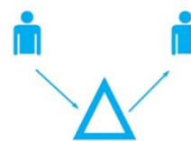
Figure 3. The centralized value transaction model with fiat money

In the digital world, value is embodied by digitalized currencies, and payments are processed through centralized banks and financial organizations. Since the invention of online payment, the centralized payment method is utilized along the time. The change appeared when the Bitcoin appeared and the popularity of Blockchain technology. In the region of financial sector, the savings from blockchain-enabled technologies achieve tens of billions of US dollars annually with 11–12 billion US dollars annually on the settlement of cash securities alone (Schneider et al., 2016).