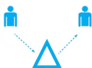
Figure 4: The centralized value transaction model with virtual currencies

endorsement for security and privacy, the risk of illegal stealing and commercializing of information remains.