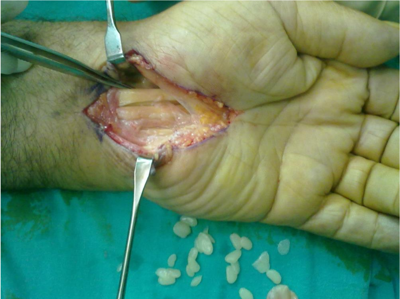
Figure 2: Peroperative appearance after debulking synovectomy and carpal tunnel release.

day, rifampicin (RMP) 600 mg /day, ethambutol (EMB) 1.5 g/day and pyrazinamid (PZA) 2 g/day were started. The complaints of the patient regressed within 2 months. After two months EMB and PZA were discontinued. INH and RMP were given for 4 months. At 26 months of follow-up the patient was doing well.