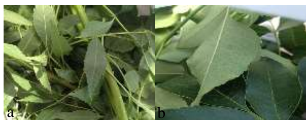
Figure 1. The leaves (a) Fraxinus excelsior , (b) Fraxinus Americana

Fraxinus excelsior and Fraxinus americana leaves (Figure 1) were washed with distilled water, and dried in the dark. Dried plant leaves were kept at +4 °C. Dried plant material was powdered and sieved before the extraction.