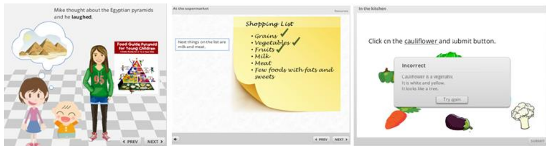
Fig. Sample screenshots from one of the e-books with informative feedback.

provided via Storybird , a desktop application that supports writing skills by providing visual and verbal prompts. All responses to quiz questions were provided with informative feedback (see the Figure below for sample screenshots).