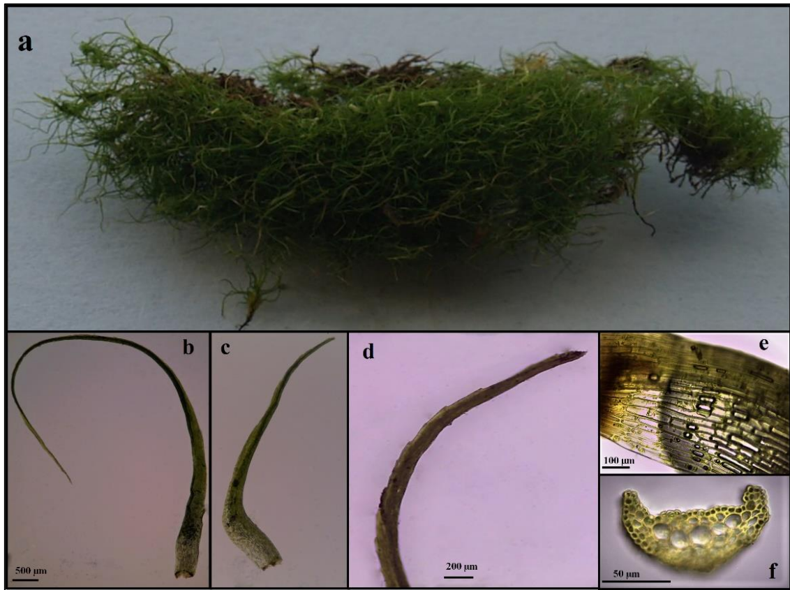
Figure 3. D. crista . a) Habitus (lightly crisped leaves), b-c) Leaves, d) Apex of the leaf, e) Basal cell, f) Cross-section of leaf