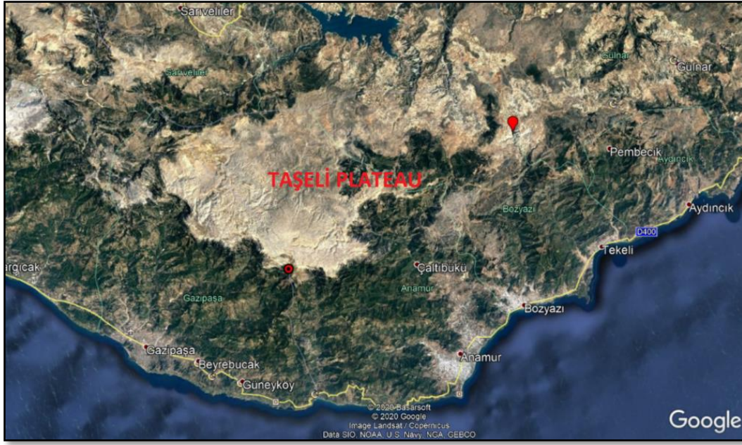
Figure 2. D. crisper and S. confusum location in Taşeli Plateau (changed from Google Earth)