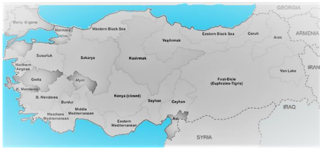
Fig. 1. River basins in Turkey