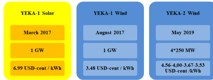
Figure. The date of tenders, volumes and the prices of the winning bids in Turkey.

An overview of the design criteria of the renewable energy auction mechanism has been provided and recommendations as required to improve the effectiveness of this mechanism has been made.