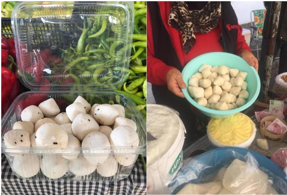
Figure 1. Katık Keş sold in Bolu local bazaars

immediately after production, or sometimes marketed after a long wait from production, or the production style habit. The values obtained were similar to the values reported by Akyüz et al. (1993). In addition, the results were lower compared with the values obtained by Güven and Karaca (2009).