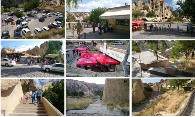
Figure 2. Some facilities and landscape properties of Göreme Open Air museum (A: Parking lot front of main entrance, B: Ticket office for museum entrance, C: Tourniquets, D and E: Ornamental shop stores, F: Sign for WC, G-I: Stairs and slope footpath).

Figure 2 shows some photographs of Göreme Open Air Museum and some facilities with some landscape properties.