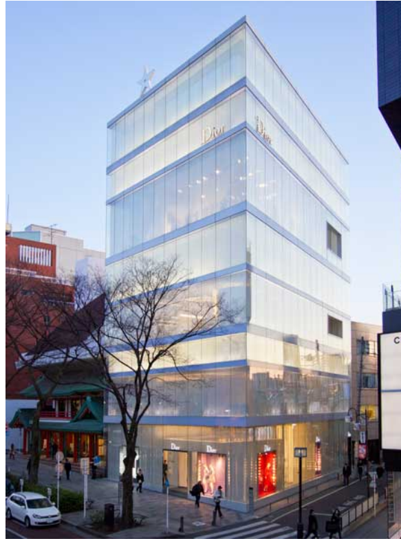
Figure 9: Dior, Tokyo, 2004 (Url-21)