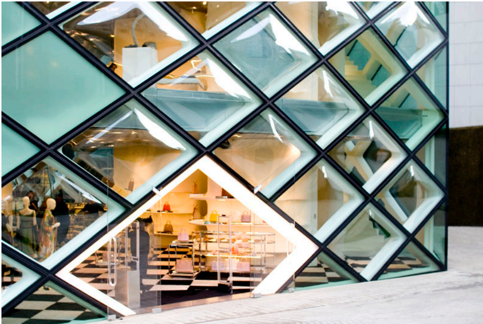
Figure 3: Prada, Tokyo, 2003 (Url-12)