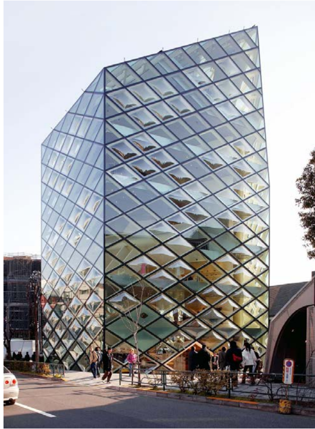
Figure 2: Prada, Tokyo, 2003 (Url-11)