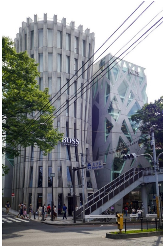
Figure 4: Hugo Boss, Tokyo, 2013 (Url-16)

Hugo Boss building was completed in 2013 by Japanese architect Norihiko Dan and Associates in Omotesando. "They wanted to imbue not only the structure but the streetscape with an imaginative and dynamic atmosphere" (Url-13). It is an eight-story building that is in a corner and surrounded by Tod's L shape building (Figure 4). Half of the building is not visible as it is located at the back whereas the visible part intersects Omotesando Street (Url-14). The architect aimed to differentiate from Tod's building next to it with its design. Dan, the architect of the building, explained that "this is to maximize the corner lot feature of the premises and to accentuate the inner vertical façade of adjacent Tod's building, in order to create certain symbiotic synergy" (Url-15). He designed the façade like multiple leaf-shaped columns, and he used a lot of reinforced concretes (Figure 5). For the concrete to be similar to the wood texture, a wooden formwork was used. Façade openings of the building are supported with steel, and these steels are illuminated from the inside by led lights. Hugo Boss building, which is one of the pioneers of contemporary architecture in Tokyo, differs from other examples in that it only sells men's products. Although, Omotesando in general appeals to women with high economic status, Hugo Boss manages to bring male customers to this street.