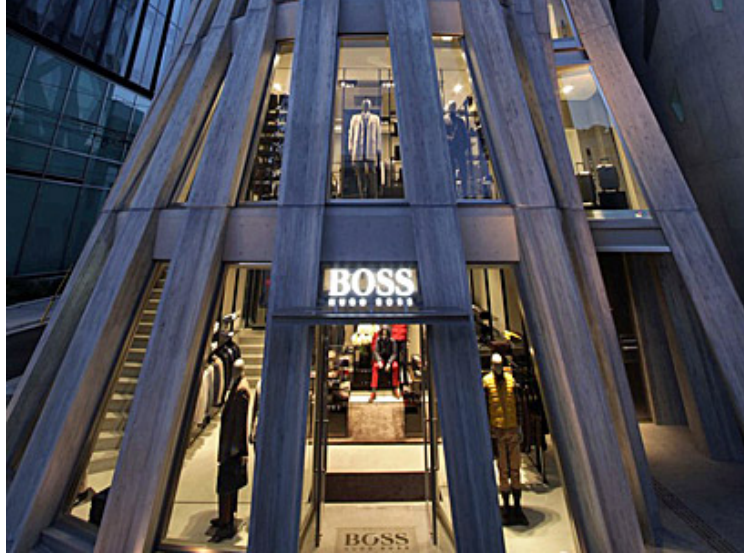
Figure 5: Hugo Boss, Tokyo, 2013 (Url-17)