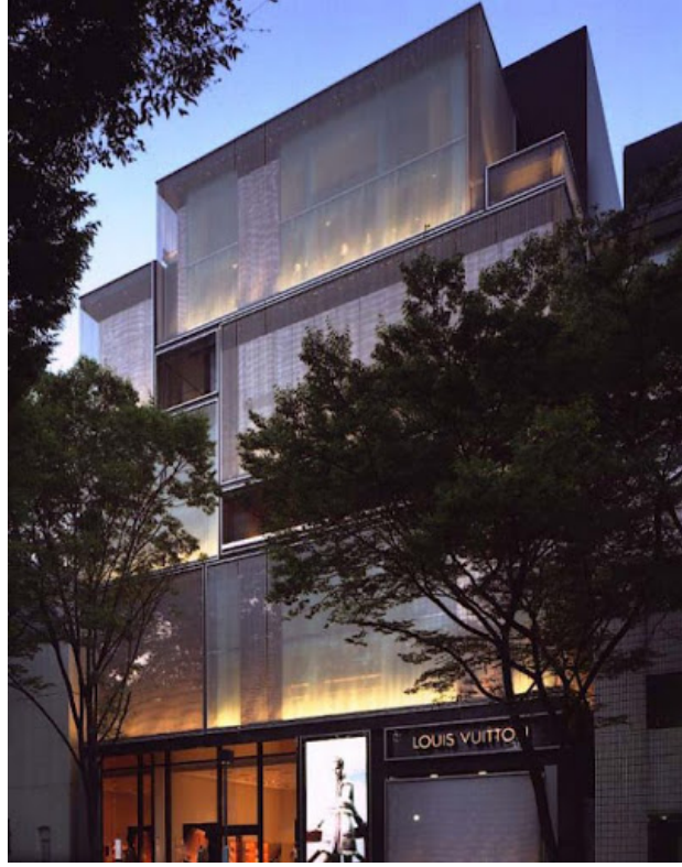
Figure 10: Louis Vuitton, Tokyo, 2011 (Url-23)