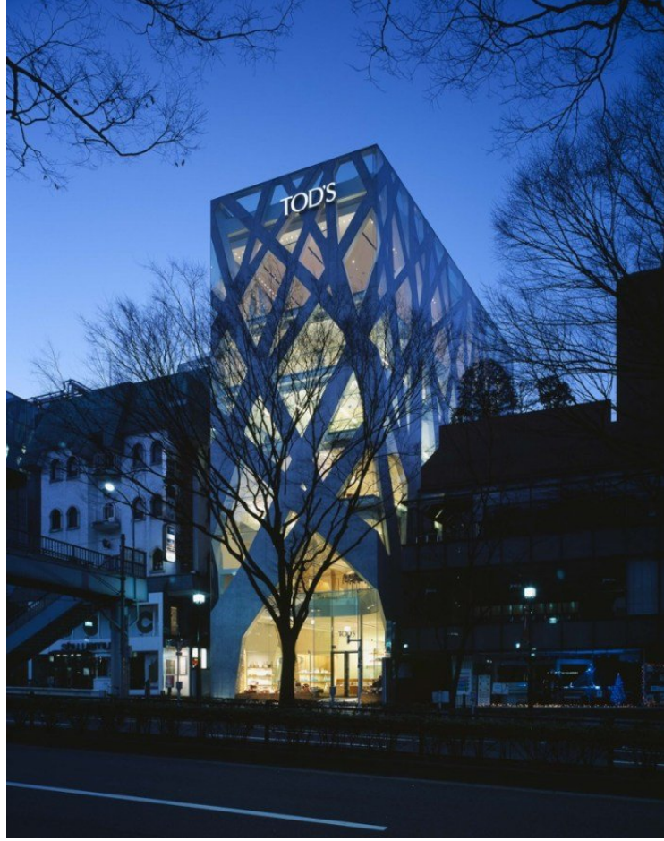
Figure 6: Tod's, Tokyo, 2004 (Url-18)