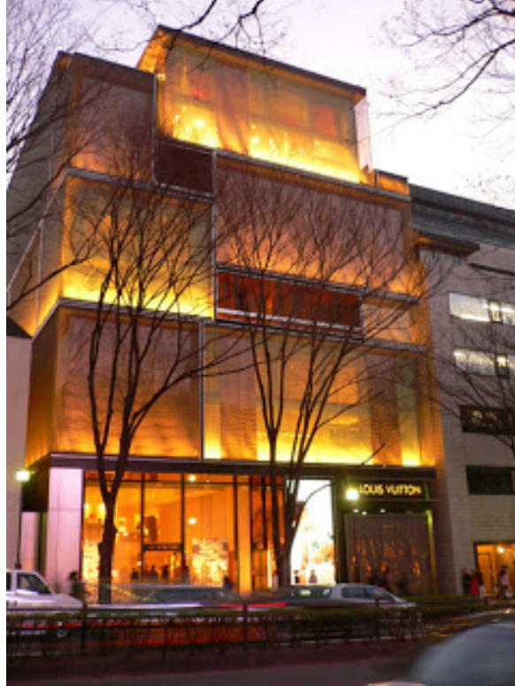
Figure 11: Louis Vuitton, Tokyo, 2011 (Url-24)