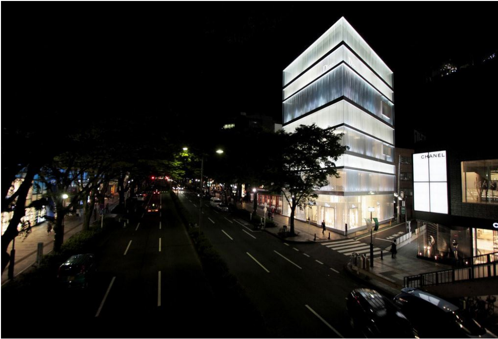
Figure 8: Dior, Tokyo, 2004 (Url-20)

Dior flagship store building was designed in 2004 by Toyo Ito's student Kazuyo Sejima in Omotesando. Like Tod's and Prada, this building is one of the oldest contemporary architectural structures in the region. The building is thirty-meter high and consists of eight floors (Figure 8). The architect, who tries to continue the architectural language used by Ito, created an elegant design. Designed just like a simple box, strong shapes or impressive light features are not used in the Dior building. White transparent glass and aluminium are used on the façade of the building (Figure 9). The most important feature of the building is the acrylic façade design. Sejima also influenced Dior's pleated skirt design when she created the façade of the building (Xie & Shen, 2013, p.2357). Dior building, which is one of the simplest designs in Omotesando Street, has an aesthetic and impressive appearance.