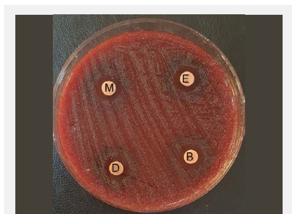
Fig. 1. DDA for Fusobacterium nucleatum (ATCC 25586); discs including methanol (M), ethanol (E), butanol (B) and distilled water (D) extracts.

The antibacterial activities observed with all four solvent extracts of S. mukorossi fruit pericarp against F. nucleatum ATCC 25586 (Fig. 1), P. gingivalis ATCC 33277 and A. odontolyticus (clinical isolate). The zone diameters are presented in Table 1. The MIC and MBC values for P. gingivalis ATCC 33277 and A. odontolyticus (clinical isolate) with ADA are presented in Table 2. Although growth inhibition exhibited a relatively high concentration in F. nucleatum ATCC 25586 with ADA, there was no bactericidal activity (Table 2).