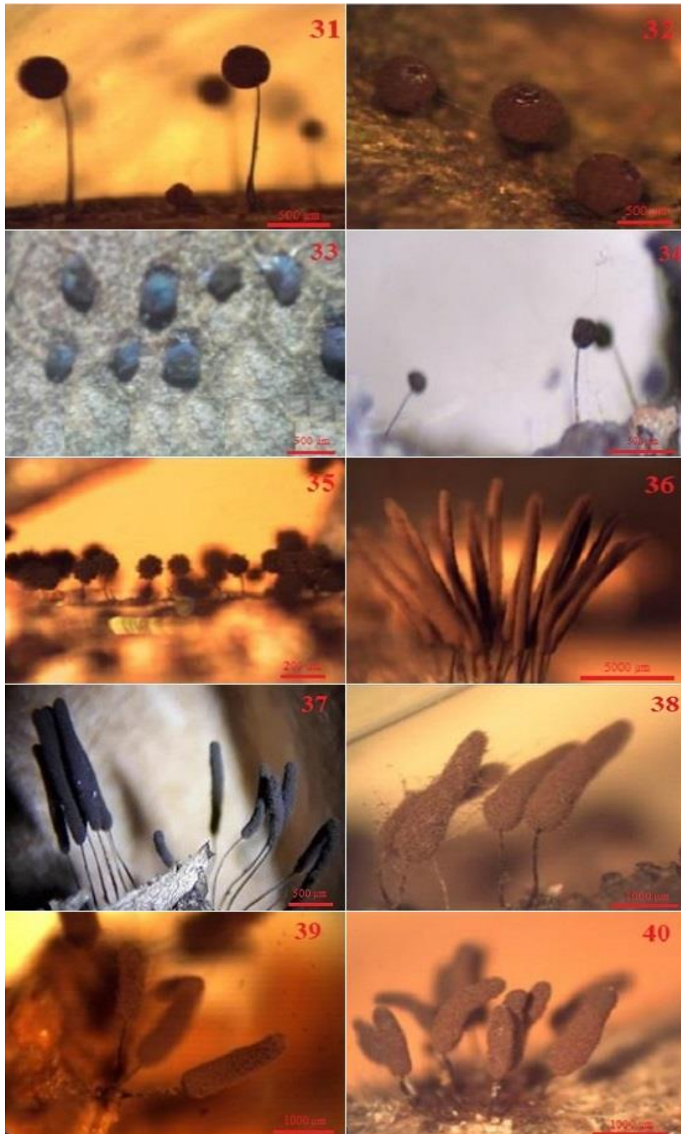
Figure 4. Myxomycete images (Cont.) (31- Comatricha nigra , 32- Enerthenema papillatum , 33- Lamproderma arcyrioides , 34- Macbrideola cornea , 35- M. decapillata , 36- Stemonitis fusca , 37- Stemonitopsis amoena , 38- S. hyperopta , 39- S. reticulata , 40- S. subcaespitosa )