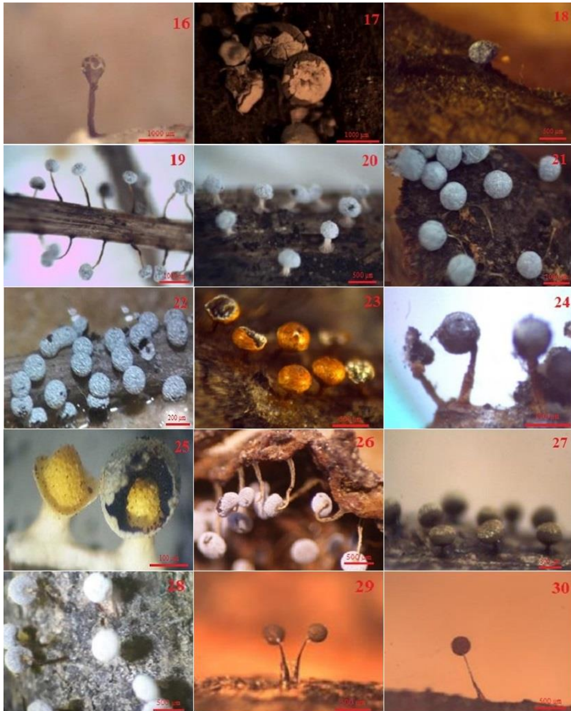
Figure 3. Myxomycetes images (Cont.) (16- T. munda , 17- Diderma hemisphaericum , 18- Didymium clavus , 19- D. megalosporum , 20- D. squamulosum , 21- Badhamia dubia , 22- B. panicea , 23- Craterium sp., 24- C. dictyosporum , 25- Physarum sp., 26- P. album , 27- P. oblatum , 28- P. robustum , 29- Collaria lurida , 30- Comatricha ellae )