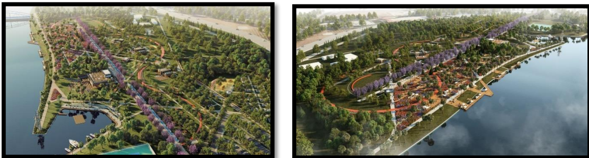
Figure 2. 3D images of the designed project

In urban planning, green spaces have different levels ranging by building, neighborhood, district, city, and district (Yücel & Yıldızcı, 2006). Especially in the planning of active green areas, it is very important to design an urban park that varies according to the size of the city in order to meet the recreational needs of the people living in the city. People who are directly affected by the negative ecosystem of the city need to be in a natural environment in their leisure time. Therefore, the adverse impacts of living in a city can be minimized by a reachable, accessible, and functional urban park. The project was highlighted by an active walkway (promenade) on the Seyhan riverfront and different focal points were created on a colored activity path forming the functional activity spine. In the project, it has been adopted that people go out on the water by platforms rather than just walkways. These points feature places for viewing and for recreational activities (hand-line fishing, nature photography, wildlife observation etc.). For this purpose, viewing platforms, wooden jetties, lighthouse, water skiing facility, marina amphitheater, optimis marina and sailing club areas were designed along the coastline. (Figure2).