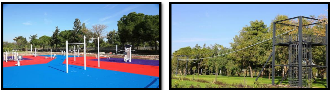
Figure 7. Figures of activity parks (left) and zipline in the area (right)