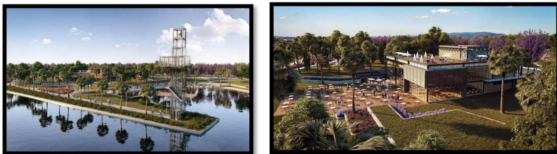
Figure 9. Figures of observation tower (left) and social facility (right) in the area.

An observation tower with steel and glass construction was built within the Adana Coastal Park project in order to view the entire area three-dimensionally and to create a striking effect in the area (Figure 9 left). This tower also forms the green amphitheater square where the floating stage is located. Both the city and the iconic buildings of Adana; Taşköprü and Sakıp Sabancı Mosques, can be seen from the observation tower. Another functional area is the social facility with a 2000 m 2 closed area and terrace facing the Seyhan riverfront (Figure 9 right).. It is planned to have wedding ceremonies and large organizations in this facility and to serve local food such as Adana kebab and turnip juice.