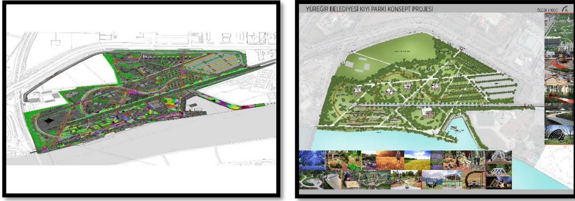
Figure 1. Plan view of the study area