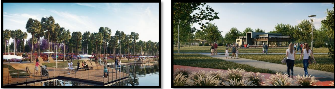
Figure 5. Figures of viewing platfotms (left) and picnic areas in the project area (right)

The Adana Coastal Park project have unifying and socializing character and include various units to serve all ages and cultures. The project design allows people to stand out on the water and take advantage of the platforms for viewing or fishing purposes (Figure 5 left). Another function planned on the field is the picnic areas. The picnic areas are located in the north of the entrance parking lot to screen off, allowing easy access for people. In the area, an alfresco café and restaurant (Figure 5 right) are planned for the handicapped and elders, which are surrounded by facilities such as children's playgrounds (Figure 6), activity parks (Figure 7 left), ziplines (Figure 7 right), and water parks (Figure 2).