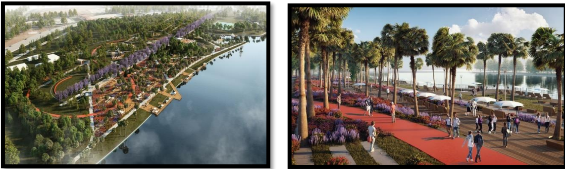
Figure 3. Samples of planting design from the area

A small botanical garden was created in the project area using 149 natural and exotic species (Figure 3). These taxa consists of; 44 Leafy Trees, 6 Coniferous Trees, 9 Palm Trees, 112 Leafed and Coniferous Shrubs, 13 Succulents, 4 Hanger and Trailers, and 6 Grass mixtures. The identification plates of these plant species have been placed under groups to enable the users learn more about the species. Besides visual planting, an area was planned in the park where observations for scientific studies can also be carried out.