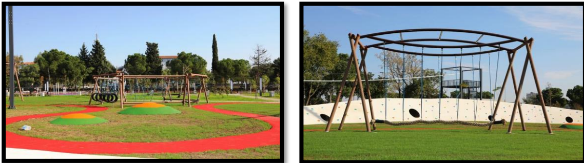
Figure 6. Figures of children's playground in the project area