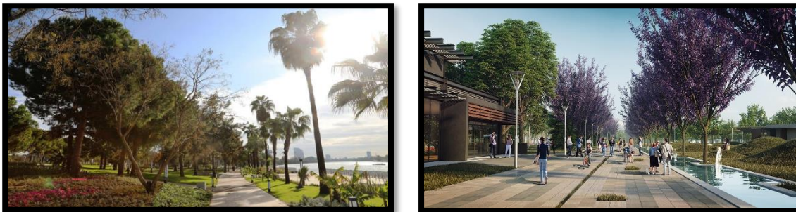
Figure 4. Figures of riverfront walking path (left) and colored activity path in the project area (right)

A city park must be the most important focal point within the urban green space system and link active or passive green spaces with green corridors. It should have an integrity in itself in terms of activity, land, plan, and design. According to related evaluations, the Adana Coastal Park Project has a waterfront walkway and a colorful activity path connecting all of these to each other, and it forms a design integrity in itself (Figure 1). The project was highlighted by an active walkway on the Seyhan riverfront and different focal points were created on a colored activity path (Figure 4 right) forming the functional activity spine (Figure 4 left).