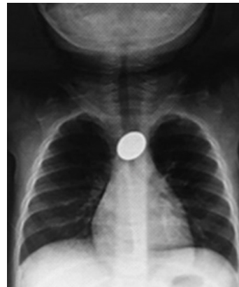
Figure 1. Foreign body in the 2nd narrowing of the esophagus in the chest X-ray.

ICU, upon decreasing the oxygen saturation, fever, continuing leakage in the control esophagography, it was decided to surgery. During the right-lateral thoracotomy, an approximately 2.5-cm-long full-thickness defect of the oesophagus was observed and repaired primarily. On postoperative day 14,