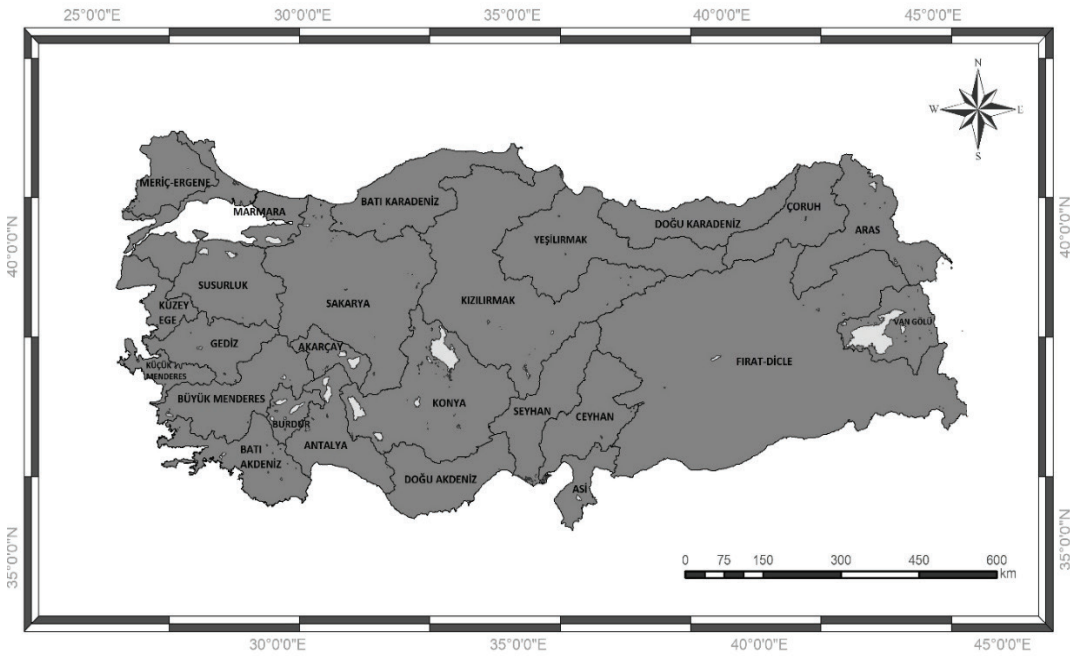
River Basins of Turkey

A total of 275 lakes, including reservoirs in 25 river basins, were sampled during the study. These lakes are given in Table 1. These lakes are grouped in 22 lake typologies based on altitude, lake depth, lake size, and geology (DGWM, 2015), and they are located between the longitudes of 26°19' and 43°54' E and the latitudes of 35°56' and 42°00' N. The altitudes of the lakes vary between from sea level (Lake Gala) and 2757 m (Lake Çamlu).