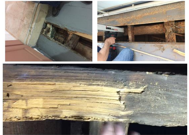
Figure 3. Evaluation of the beams by Resistograph.

Screw withdrawal resistance results: The wooden beams in 15 rooms of the Santa Maria Church were evaluated by Screw withdrawal resistance meter in order to determine screw withdrawal resistance, modulus of rupture (MOR) and shear resistance. Screw withdrawal resistance, MOR and shear resistance of the beams are given in Table 1.