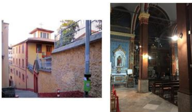
Figure 1. Santa Maria Church.

In this study, Santa Maria Church (Figure 1) which is about 150 years old was studied. The damage and defects in the Santa Maria Church were determined by non-destructive test devices including Resistograph and FAKOPP Screw withdrawal resistance meter. In addition, screw holding, shear and elasticity modulus of the wooden beams in the structure were determined.