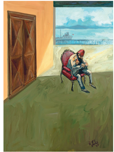
Figure 4: Özer Kabaş, Exile , 1968. Oil on canvas, 120 x 90.2 cm. Grey Art Gallery, NYU Art Collection. Gift of Abby Weed Grey, G1975.301.