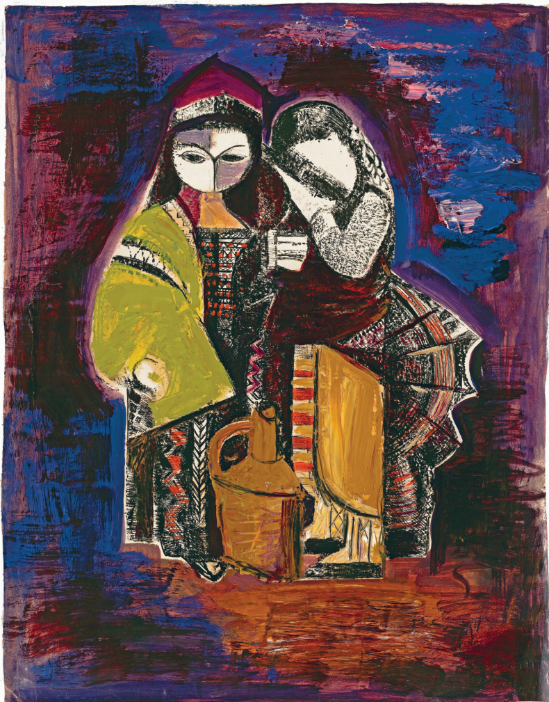
Figure 2: Eren Eyüboğlu, Two Sisters , n.d. Oil and lithograph on paper, 56.5 x 44.5 cm. Grey Art Gallery, NYU Art Collection. Gift of Abby Weed Grey, G1975.24.

as in Mustafa Ashier's Anatolia (1960) and Eren Eyüboğlu's Two Sisters (n.d.) (fig. 2); reconsidering the "traditional" through a new lens, whether it be Prabhakar Barwe's references to Tantra in Yantra III (1964) (fig. 3) or Mumtaz Sultan Ali's depiction of the deity Shiva in Her Dream (1969); and the broad scope of the artists' abilities, which push the boundaries of what can be considered "art," such as Siah Armajani's shift from repetitive writing in Calligraphy (1964) to repetition through computer typing in Print Apple 2 (1967). Additionally, some artists responded to specific historical and contemporary events, such as Özer Kabaş (fig. 4), who painted two of the most haunting works featured. In Exile (1968), a man, presumably the last Ottoman sultan, Mehmed VI, wears a fez and sits hunched in de-