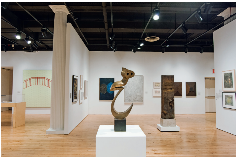
Figure 1: Installation image of Modernisms: Iranian, Turkish, and Indian Highlights from NYU's Abby Grey Collection at Grey Art Gallery, NYU, featuring Parviz Tanavoli, Heech (Nothing), 1972, Grey Art Gallery, NYU Art Collection.