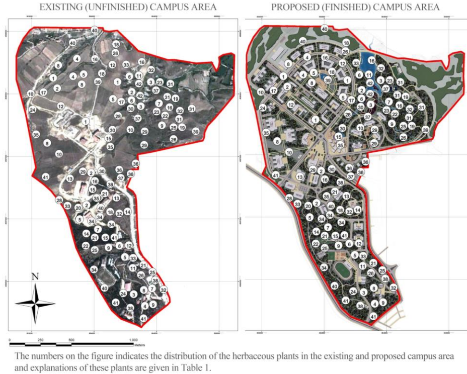
Figure 2. Spatial distribution of natural herbaceous species in Kastamonu University's Kuzeykent campus area

Adonis flammea Jacq., (red blossom color) Muscari armeniacum Leichtlin, Consolida orientalis (Gay.) Schröd., Salvia hypargeia Fisch.& Mey, Globularia trichosantha Fisch.& Mey., and Ajuga orientalis L., Viola sieheana Becker, Viola parvula Tineo detected in the area may be used as ground cover as the purplish and blue colors and may emphasize features. Berberis vulgaris L. is a species that should be evaluated with its yellow blossoms, red fruits, and aesthetic leaves. Furthermore, the species is a member of herbs. Further, labeling with of an educational nature is significant. Bellis perennis L., Muscari armeniacum Leichtlin, Viola sieheana Becker and Viola parvula Tineo are species that may be used around artificial lakes, which will be constructed in the campus area. Bellis perennis L., Tripleurospermum tenuifolium (Kit.) Freyn,