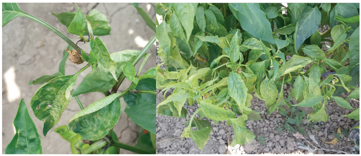
Figure 1. Symptoms on infected plants collected during surveys

Pepper ranks second after tomato in terms of vegetable cultivation and vegetable production is an important source of income for farmers. Previously, pepper leaf samples were collected from pepper growing areas Tokat Central, Turhal, Pazar, Erbaa and Niksar districts of Tokat in July-August 2016. During the surveys, typical TSWV symptoms