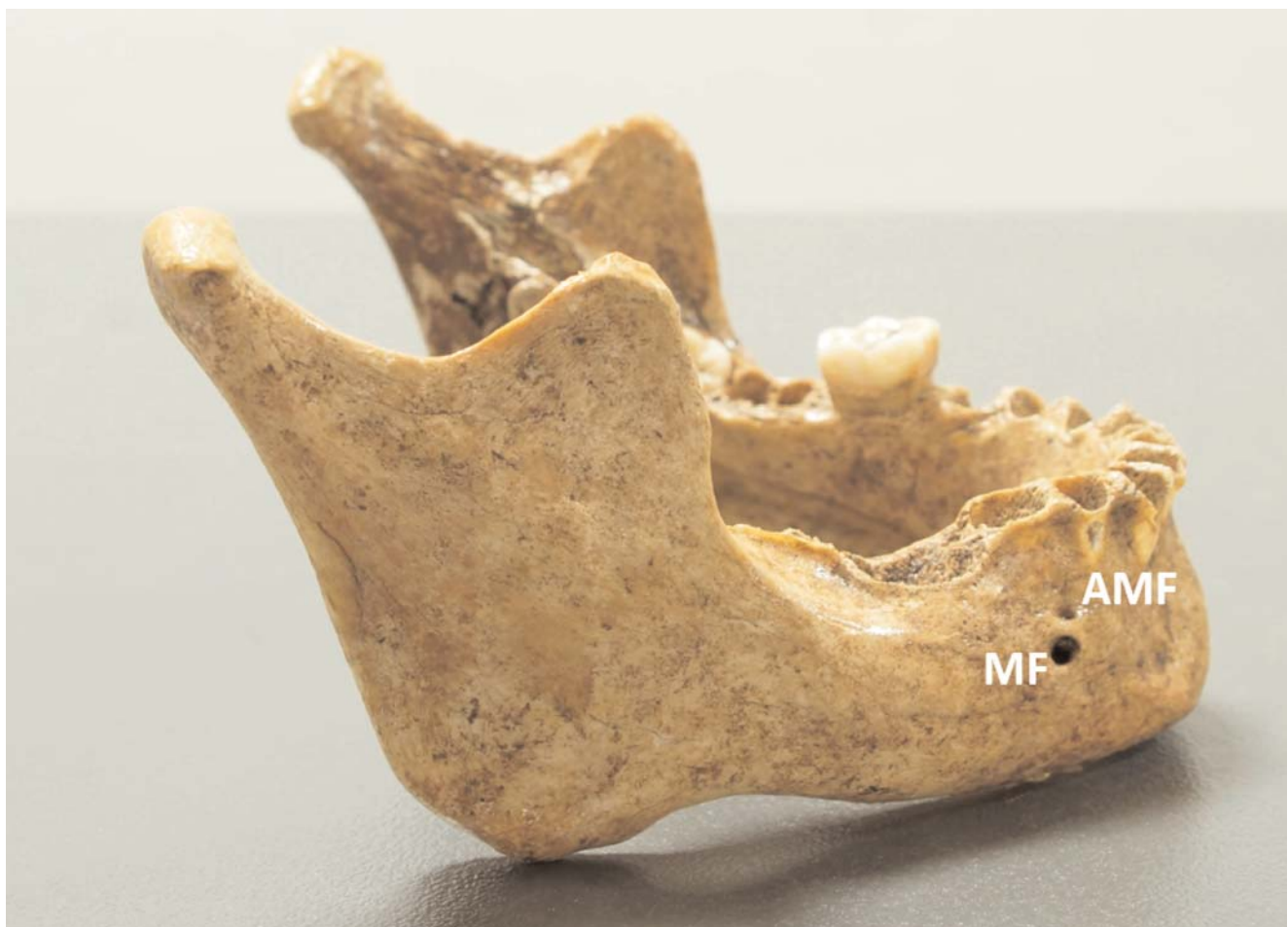
Figure 1. The mental foramen (MF) and accessory mental foramen (AMF) in a mandible.

Eleven (15.71%) accessory mental foramens were detected in 35 mandibles (70 sides) (Figure 1). Six (54.55%) of the accessory mental foramens were on the left side, and 5 of