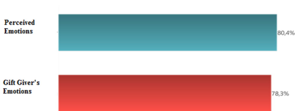
Figure 4. Distribution of Sub-themes Related to Emotion Factor

and the gift giver's emotions (n = 36) are expressed at a close rate. There is distribution of sub-themes related to emotion factor below: