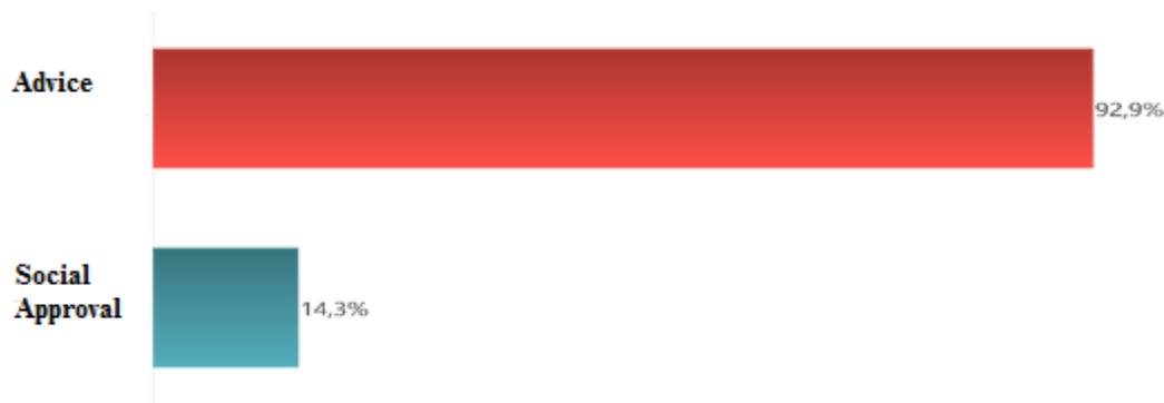
Figure 5. Distribution of Sub-themes Related to Social Factor

The concept of social approval is expressed as a need that people consider others' expectations important, give importance to other people's judgments, and individuals who engage in social interactions endeavor to exhibit adaptive behaviors. The results of the analysis showed that the approval of the participants in their social relationships for gift behavior was effective on their emotional satisfaction.