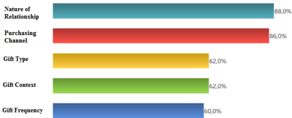
Figure 2. Distribution of Sub-themes Related to Gift Factor

The qualitative analysis results of the gift factor, which is one of the factors affecting emotional satisfaction, showed that the subthemes of nature of relationship, purchasing channel, gift type, gift context and gift frequency were observed, respectively. It is seen that the participants mostly used expressions related to the subthemes of nature of relationship (n = 44) and purchasing channel (n = 43). Then, the subthemes of gift type (n = 31), gift context (n = 31) and gift frequency (n = 30) were observed, respectively. There is distribution of sub-themes related to gift factor below: