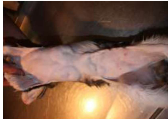
Figure 3: Mammary lobes at the end of the 3 rd week

hemogram parameters were within normal ranges, serum progesterone and oestradiol concentrations were 0.142 ng/ml and <5.0 pg/ml respectively. During the treatment period neither local nor systemic side effects related to aglepristone and cabergoline administrations was seen.