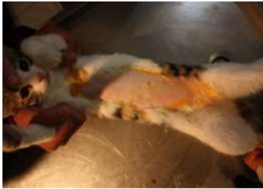
Figure 4: Mammary lobes at the end of the 6th week

practical for the regression of the mammary glands and the termination of undesirable lactation. Keskin et al. (2008) found cabergoline effective (5 µg/kg b.w./day for 14 days) to cease milk production in a pregnant queen having mammary hyperplasia. In this case cabergoline was accompanied to aglepristone treatment in order to prevent the undesirable lactation and help in the regression of the mammary glands. No side effects were observed in this case as well as Keskin et al. (2008) did not report any undesirable effect caused by the dosage of 5 µg/kg b.w./day cabergoline administration.