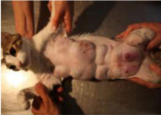
Figure 1: Mammary lobes on the presentation