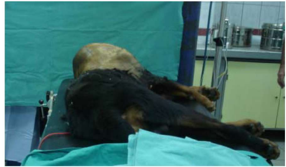
Figure 2. Fluctuant mass about the size of a soccer ball was observed including the right shoulder and neck region.

Şekil 1. Sağ omuz bölgesi ve boyunda şişkinlik.