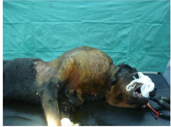
Figure 1. Swelling in the right shoulder joint and neck.

On examination a fluctuant mass about the size of a soccer ball was observed including the right shoulder and neck region (Figures 1, 2). It was reported that the general welfare of the patient gradually deteriorated and it could hardly walk. It was also reported that treatment of hematoma had been performed on the mass for 4 weeks. When the drain was controlled, drainage of fluid containing blood was observed. Anemia and leucocytosis was determined on examination of the blood. A date for operation was determined for extirpation of the mass or amputation of the extremity. Fol-