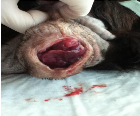
Figure 2. A mass arising from the vagina and hanging from the vulva.

Şekil 1. Köpekte pyometra teşhis edildi ve köpeğin kısırlaştırılması yapıldı. Siyah oklar irin birikimine bağlı olarak genişlemiş uterus kornularını gösteriyor.