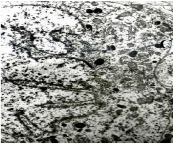
Figure 2. A fragment of the neuron underwent reparative alterations in the III-V layers of limbic cortex of the rats under 36 h total sleep deprivation. x 16.000.

the neurons of the III-V layers of the frontal limbic cortex