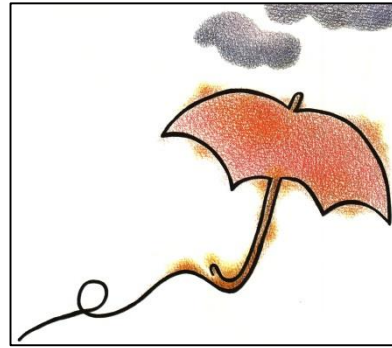
(Öğmel, 2010: 27)